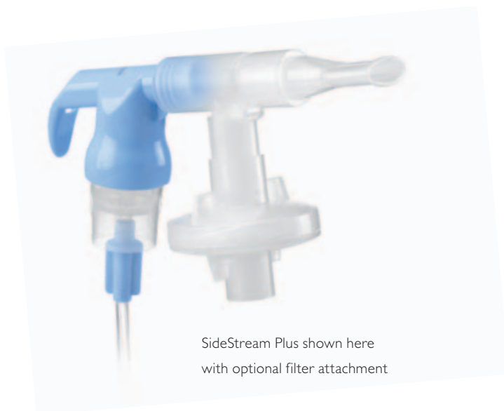
SideStream Plus shown here with optional filter attachment

Optional durable filter attachment (with disposable filter pads), or aerosol hose, for nebulizing antibiotics.